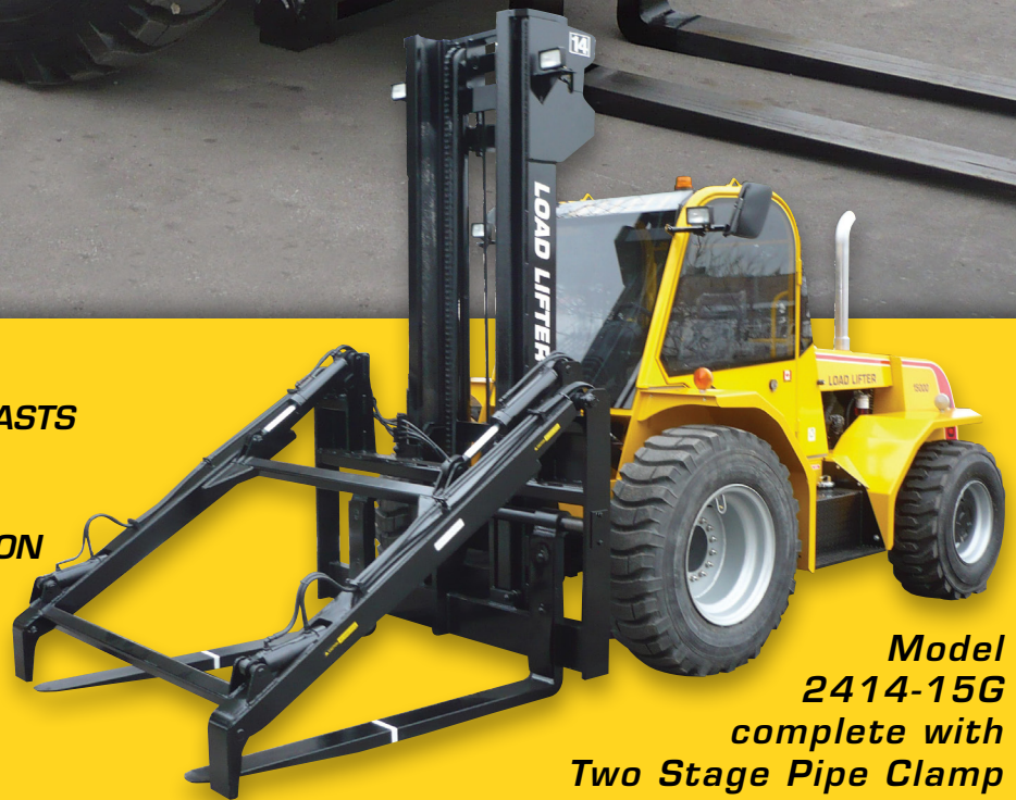
Model 2414-15G complete with Two Stage Pipe Clamp